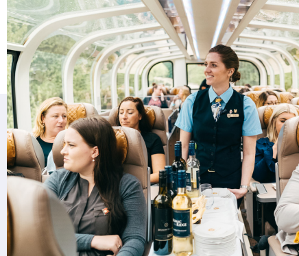
Complimentary Wine & Cheese