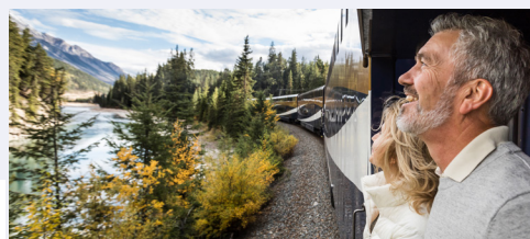
Exclusive Outdoor Viewing Platform