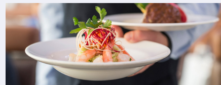
Gourmet Food crafted by Signature Chefs